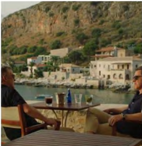
Steve Coogan & Rob Brydon in Michael Winterbottom's The Trip to Greece on location in Peloponnese, Greece

invoices. A cultural test applies. The eligible costs in the tax relief are the same as the eligible costs in the cash rebate. The two incentives are complementary but you need to apply for each one separately. Both the 40% cash rebate and the 30% tax relief are administered by EKOME, the Greek National Centre of Audiovisual Media and Communication.