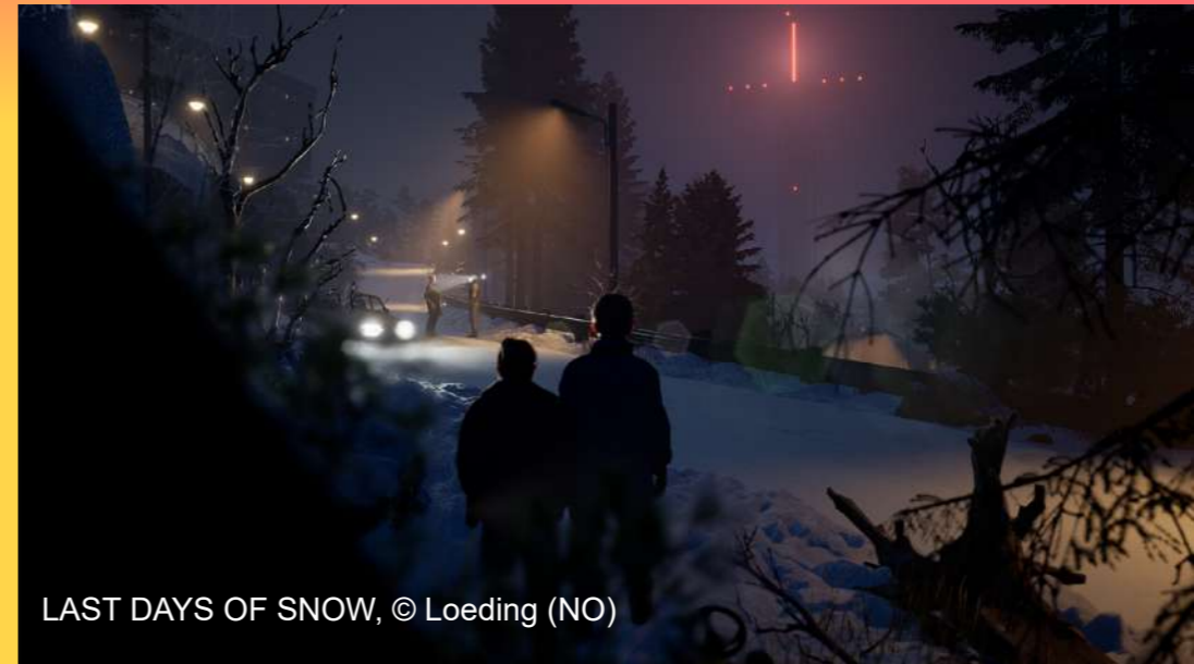
LAST DAYS OF SNOW