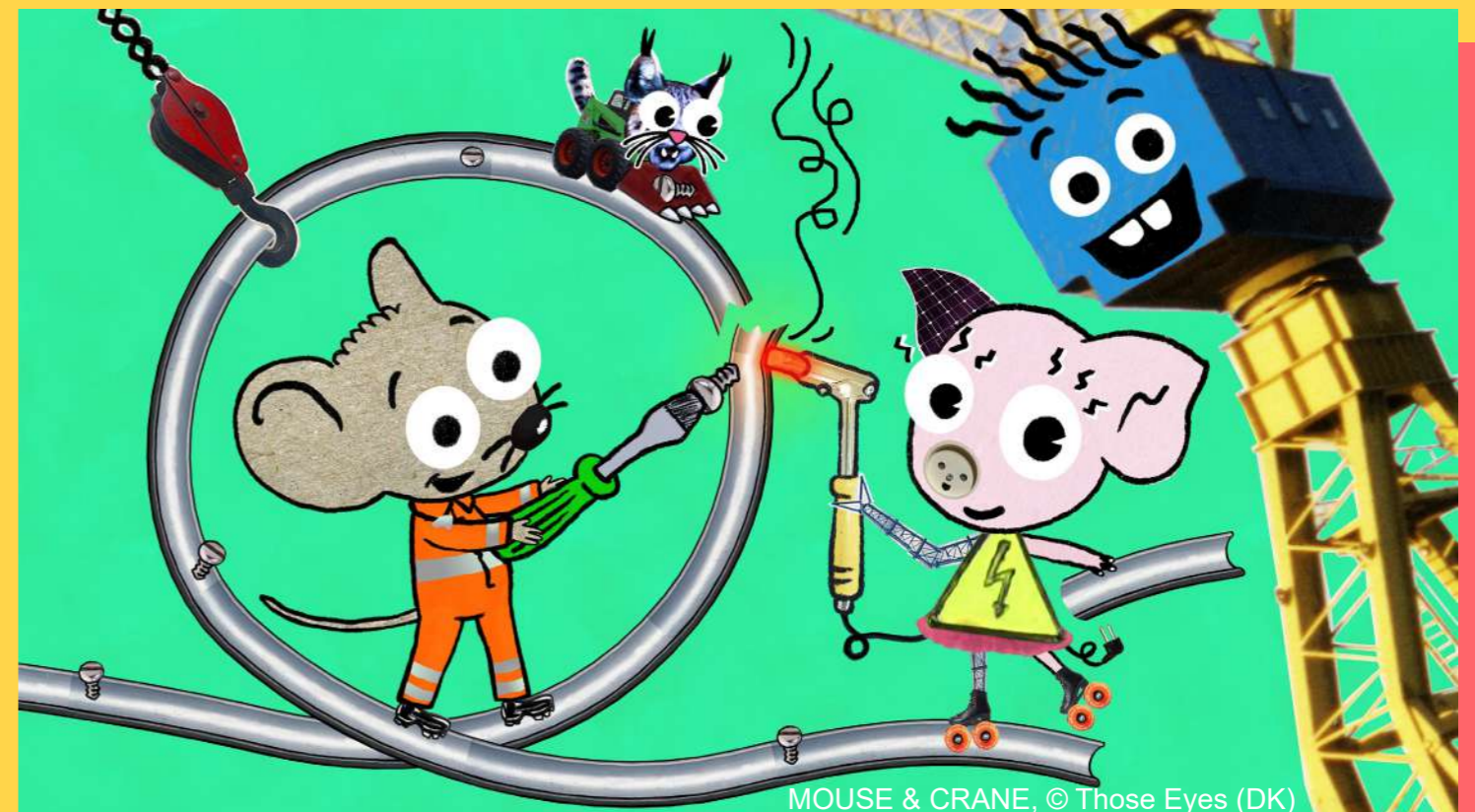
MOUSE & CRANE