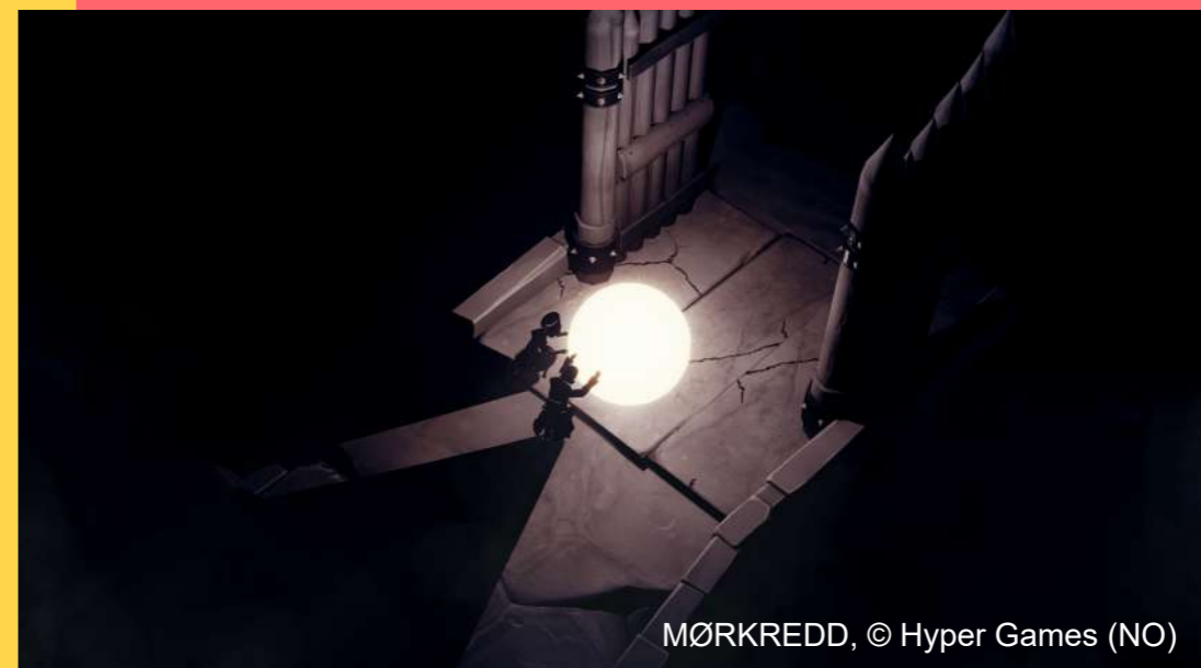
MØRKREDD, © Hyper Games (NO)