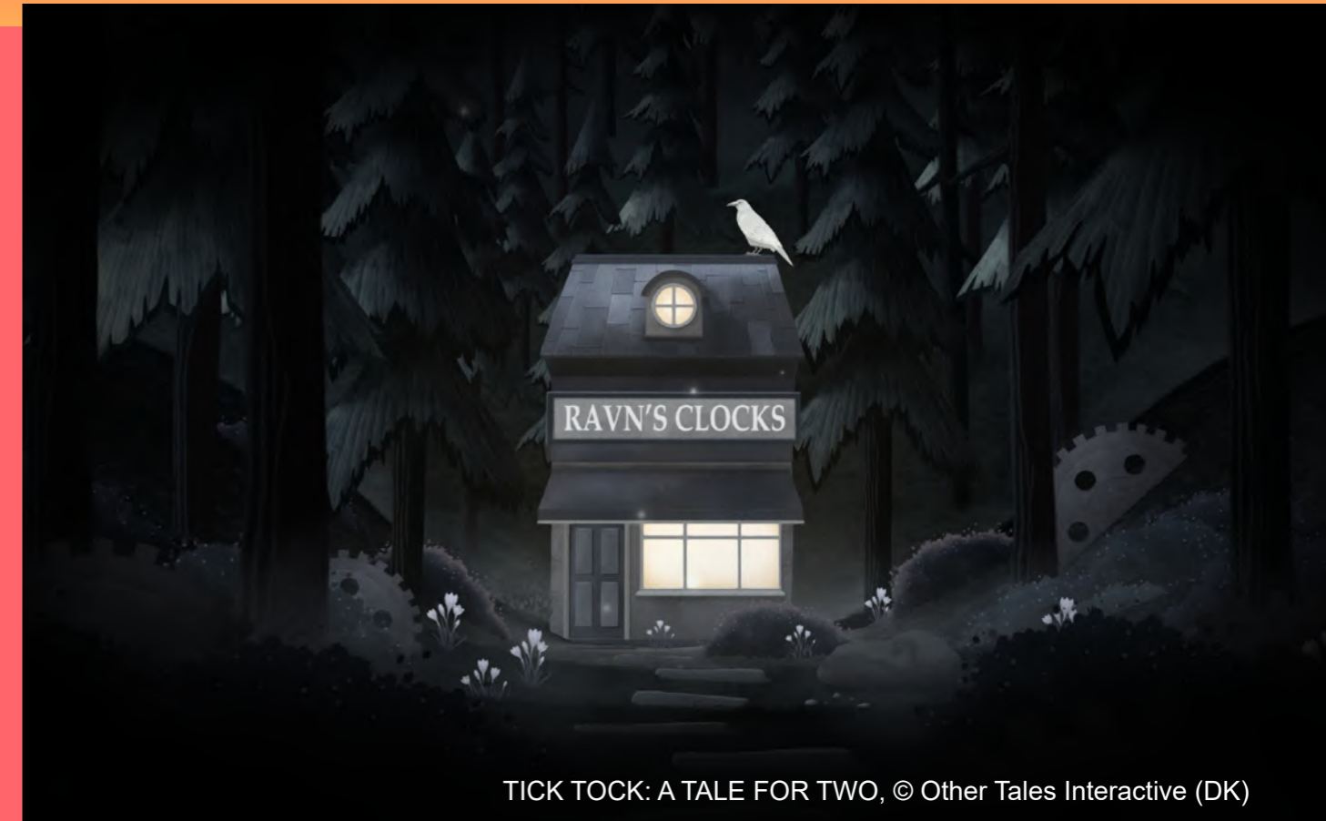
TICK TOCK: A TALE FOR TWO, © Other Tales Interactive (DK)

The Games Scheme has no fixed limit for the development, production and launch stages.