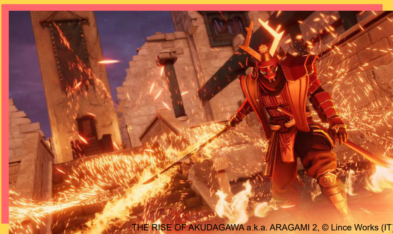
THE RISE OF AKUDAGAWA a.k.a. ARAGAMI 2, © Lince Works (IT)

Catalan: https://icec.gencat.cat/ca/tramits/tramits-temes/Ajuts-a-projectes-en-lambit-dels-videojocs-i-el-multimedia