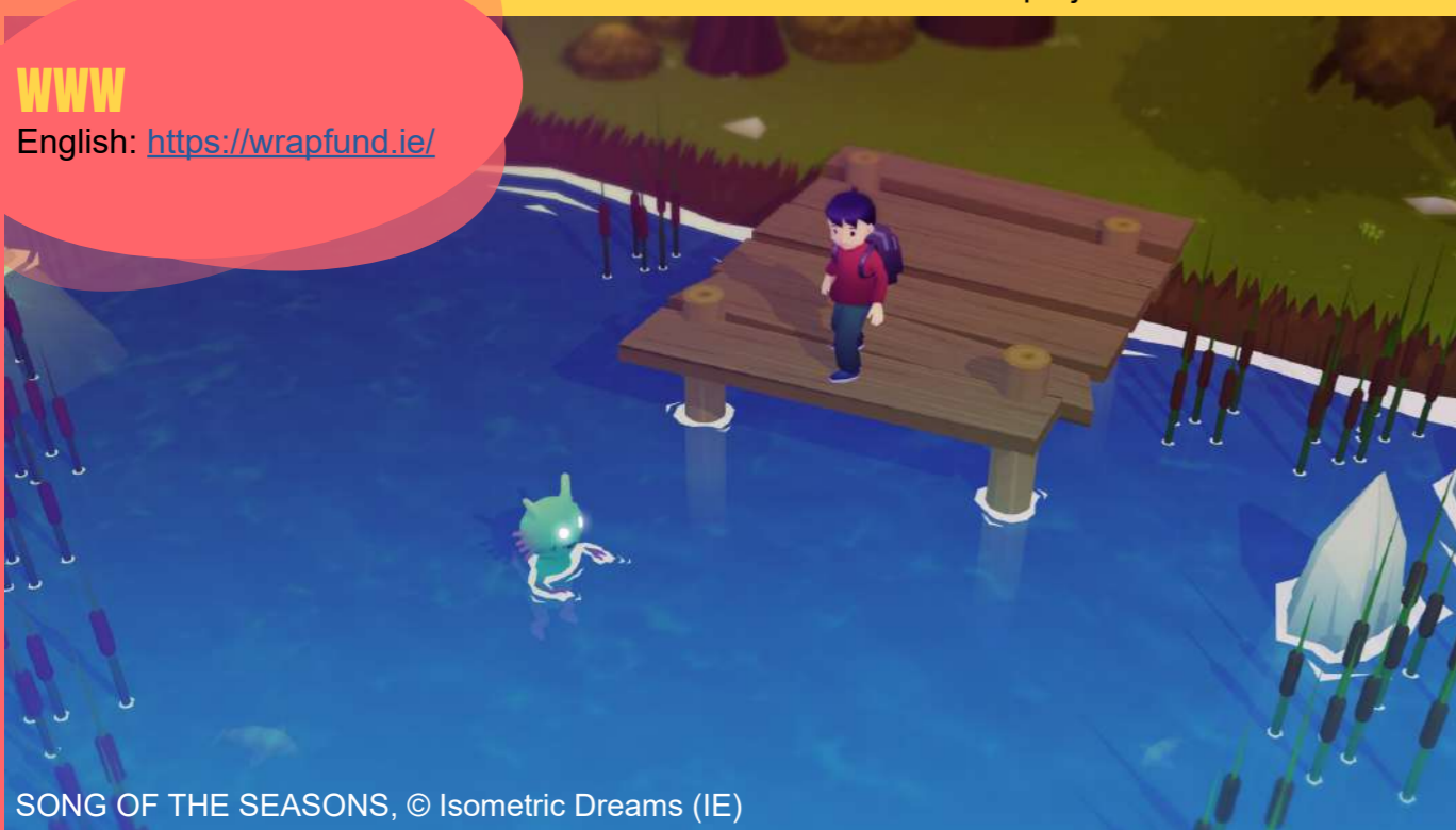
SONG OF THE SEASONS, © Isometric Dreams (IE)