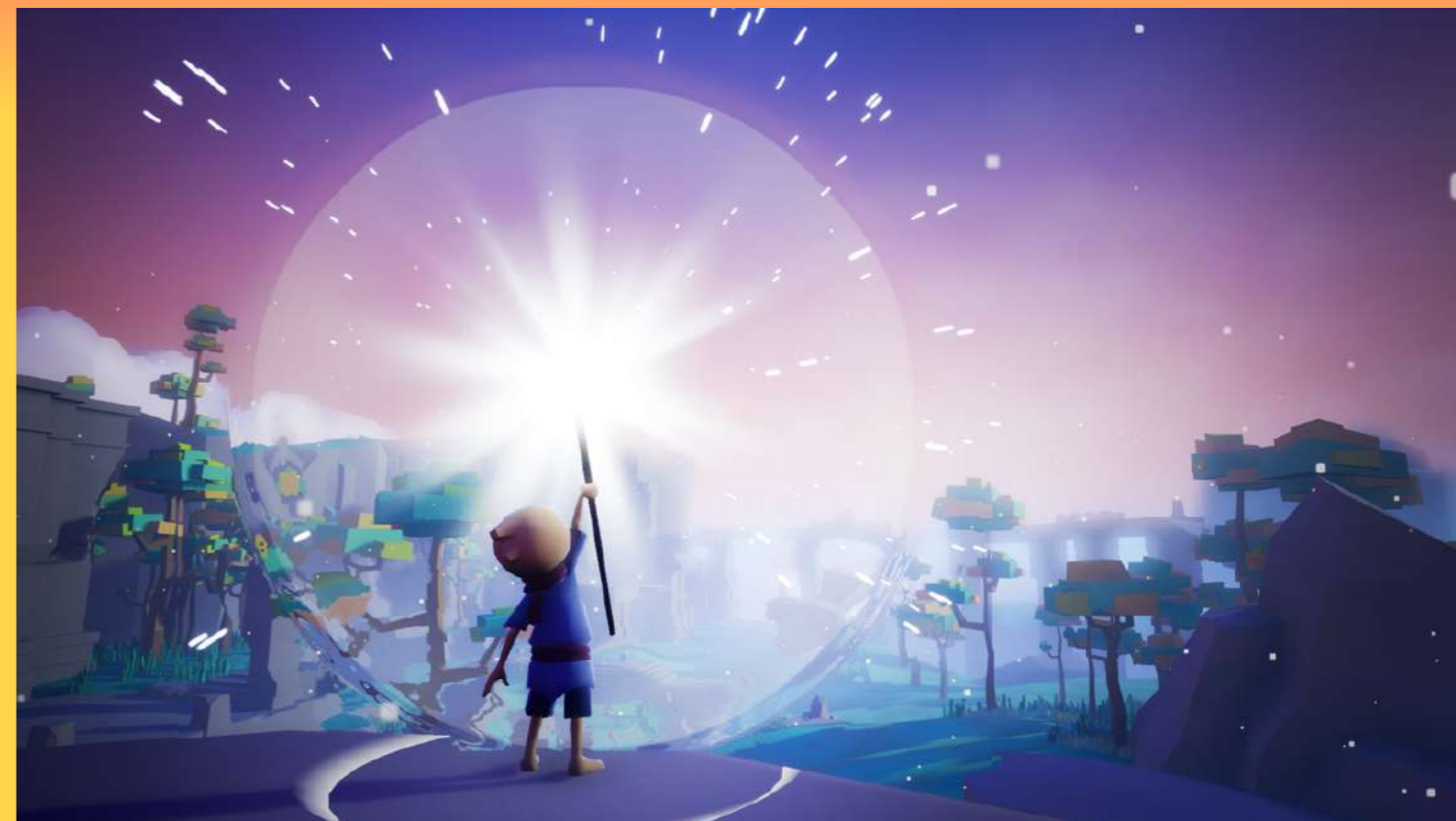
OMNO, © Studio Inkyfox (DE)

German: https://www.filmstiftung.de/foerderung/games-interaktive-inhalte/