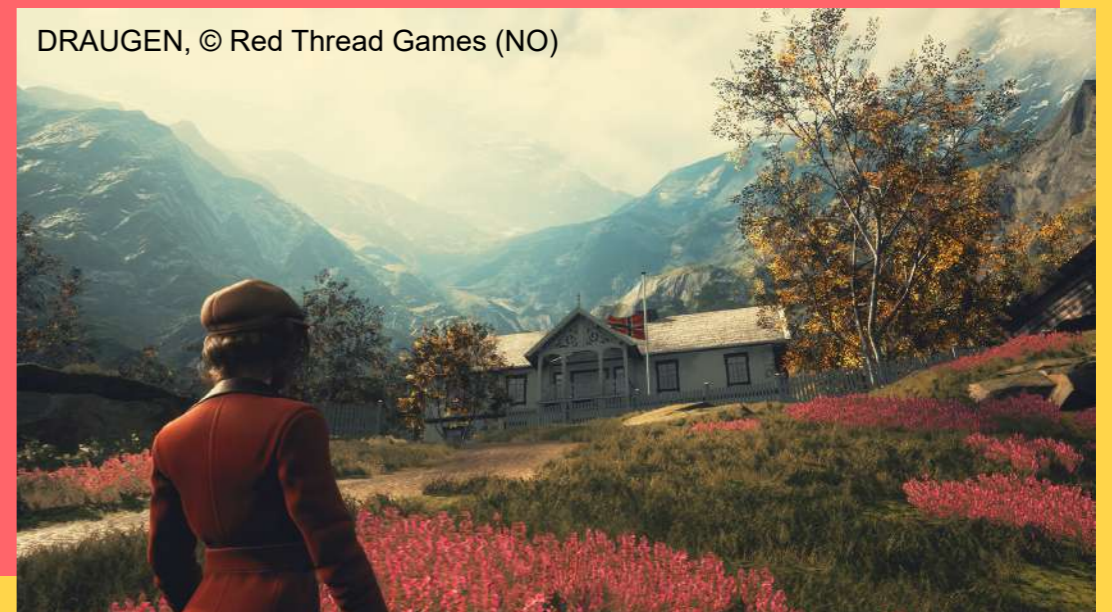
DRAUGEN, © Red Thread Games (NO)